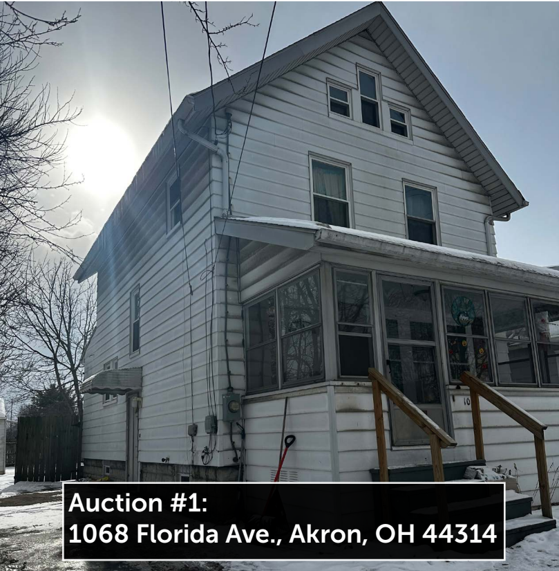
Auction #1: 1068 Florida Ave., Akron, OH 44314