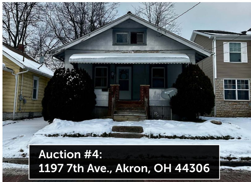
Auction #4: 1197 7th Ave., Akron, OH 44306