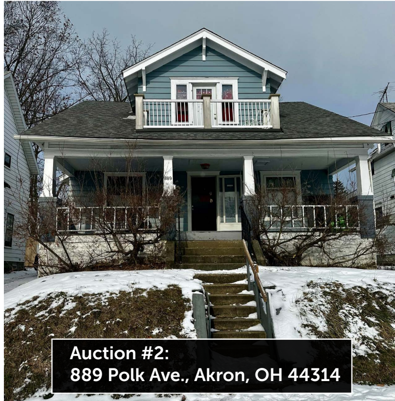
Auction #2: 889 Polk Ave., Akron, OH 44314