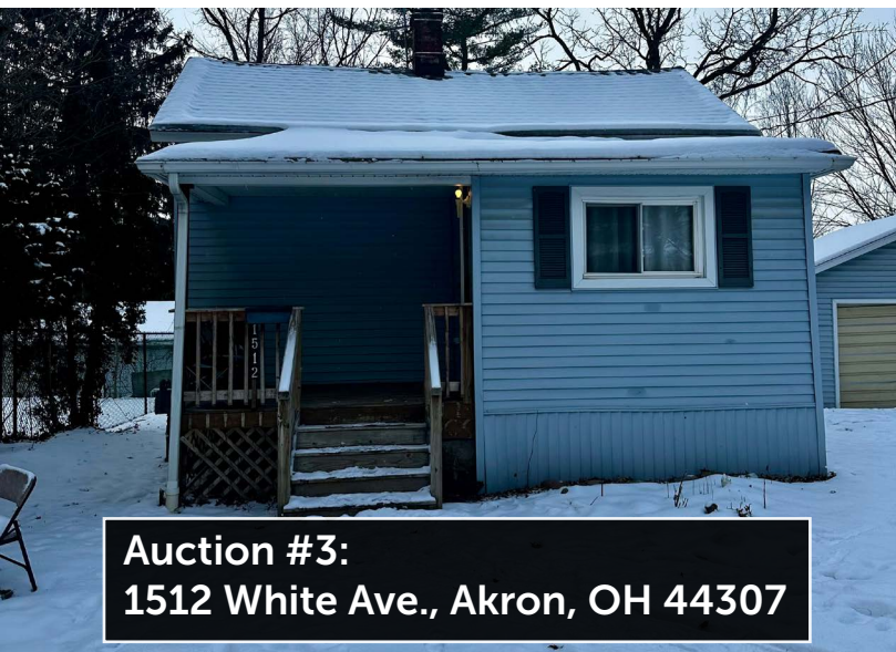
Auction #3: 1512 White Ave., Akron, OH 44307