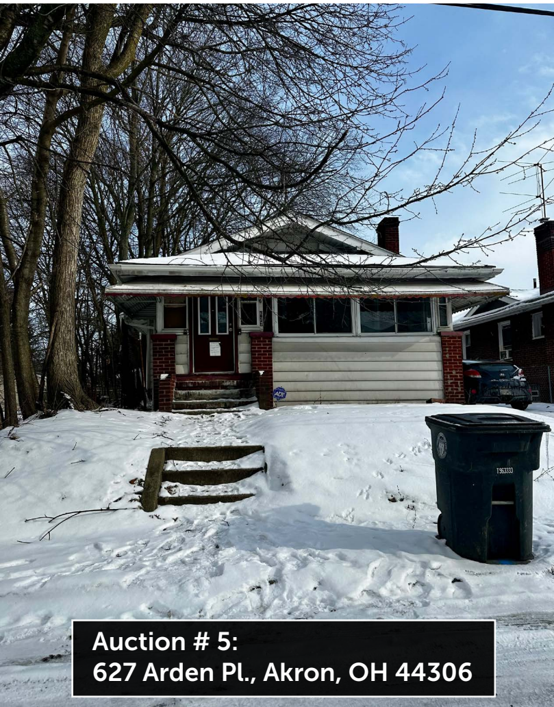
Auction # 5: 627 Arden Pl., Akron, OH 44306