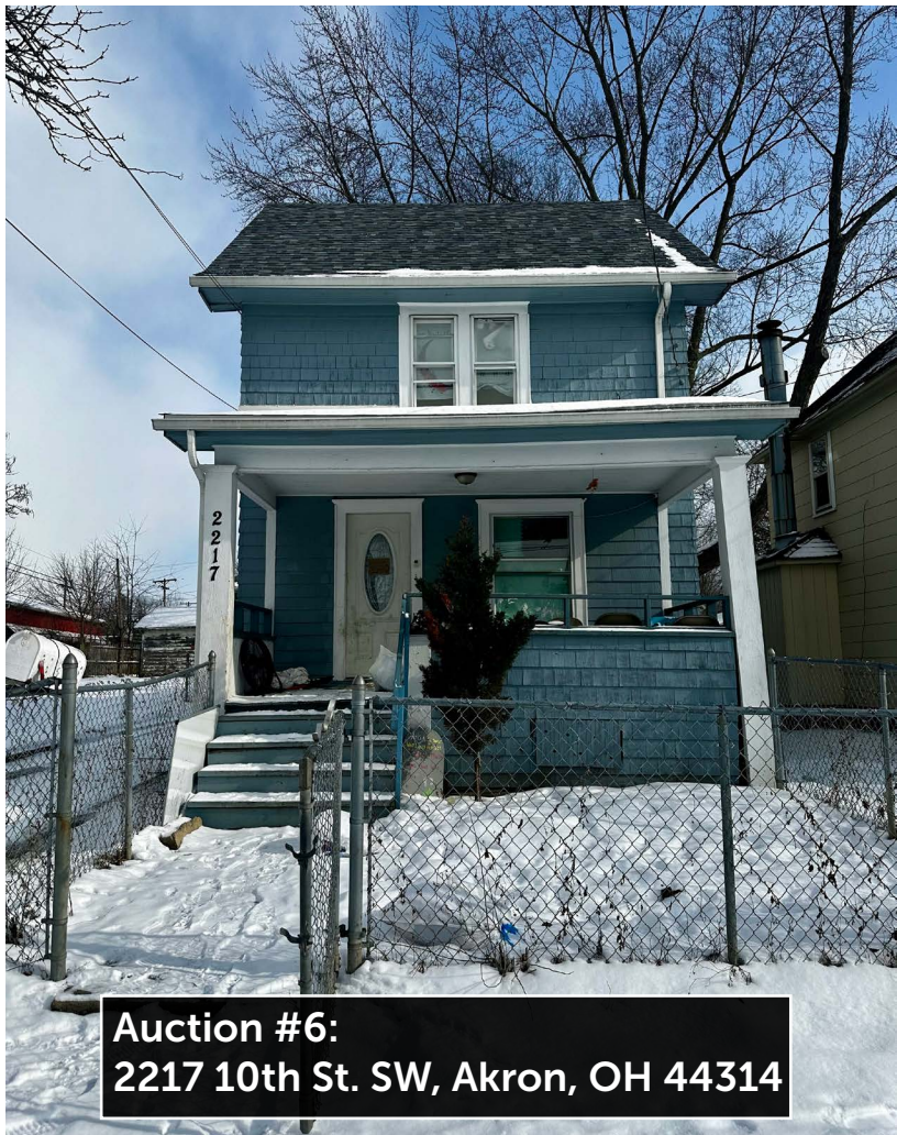
Auction #6: 2217 10th St. SW, Akron, OH 44314

Auction #1.1068 Florida Ave., Akron, OH 44314. (3) bedroom, (1) bath home, bonus room in finished attic, water owner expense, balance utilities tenant, remodeled bath, new vinyl flooring, fully fenced backyard. Rent is $1,205 per month. Section-8. Summit Co. parcels: #6724976, #6736394. Half year taxes are $667.